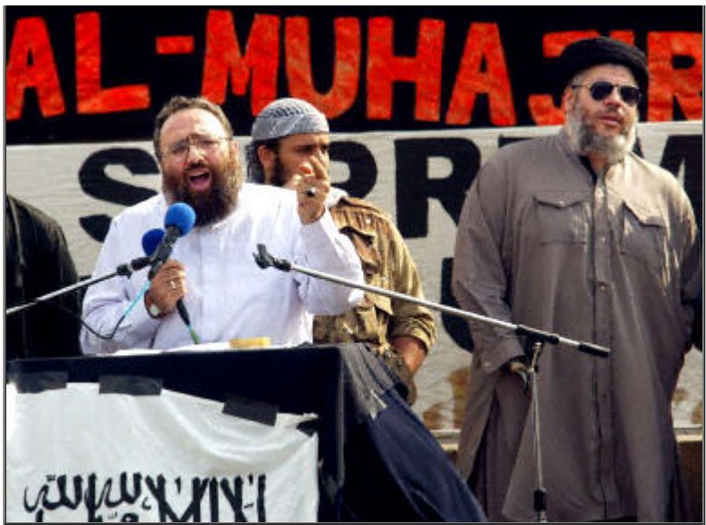
Omar Bakri Muhammed addresses an al-Muhajiroun rally <u>in</u> <u>Trafalgar Square</u>, London (Abu-Hamza, right)

The British Government ran a 'Covenant Of Security' with radical Islamic groups like Al-Muhajiroun leaving them free to recruit for terrorist missions abroad as long as they did not attack targets in Britain. During the 1990s British intelligence used al-Muhajiroun to carry out attacks against Serbia as part of strategy to dismember the former Yugolsavia. Al-Muhajiroun withdrew from the covenant following the Anglo-American invasion of Iraq in 2003, leaving it free to support attacks on the United Kingdom such as those carried out in July 2005.