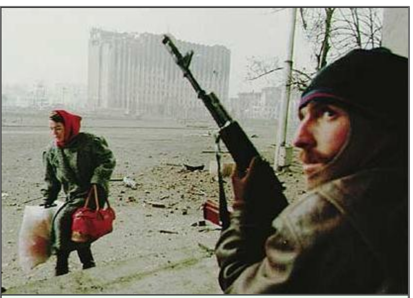
Above, A Devastated Grozny In Chechnya During The Civil War That Followed The Fall Of The Berlin Wall And The End Of The Soviet Union

Sergei Lavrov, Foreign Minister of the Russian Federation - Interview The National Interest, 29 March 2017